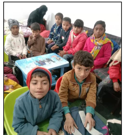
Save the Faith Schoolchildren

Thank you for helping change young lives om Pakistan and shine the light and love of Christ!