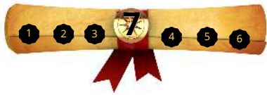
Revelation 6, 8:1