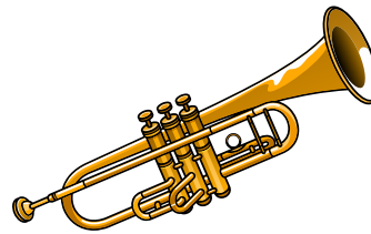
Revelation 8, 9, 11:15-19

If the Lord had not cut short those days, no one would be saved. But because of the elect, whom he chose, he has cut them short. (Mark 13:20)