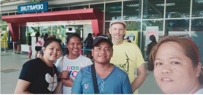
Team in Palawan