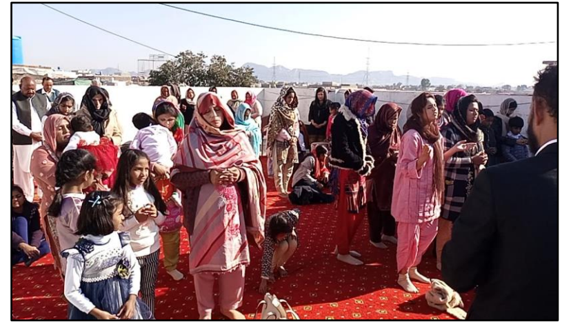
Save the Faith Biblical Unitarian Prayer Meeting