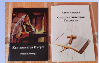
Who is Jesus & Systematic Theology