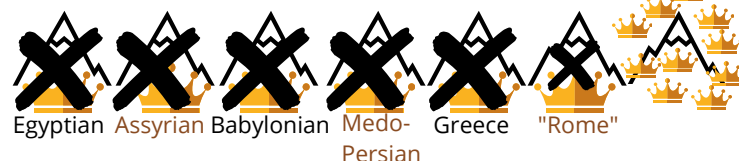
Egyptian Assyrian Babylonian Medo-Persian Greece "Rome"