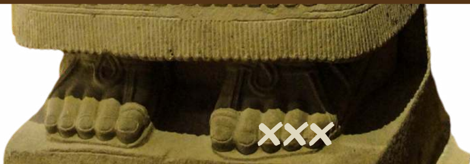
Feet (10 Toes) - 10 Horns - 10 Heads

(10 kings that not yet received a kingdom)